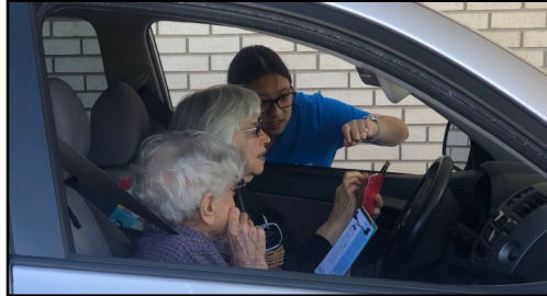
Signing up for the First 2 Know text line.