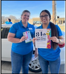
Annual Reports & mini clipboards for all!