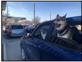
Waiting for the dog treat!