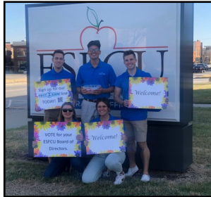
Welcome to the 84th Annual Meeting!